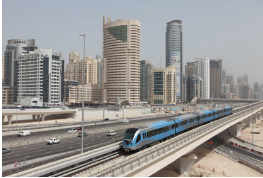
Transportation Systems Division

The Dubai Metro infrastructure was designed to support economic growth in Dubai, and is the first urban railway in the Gulf States.