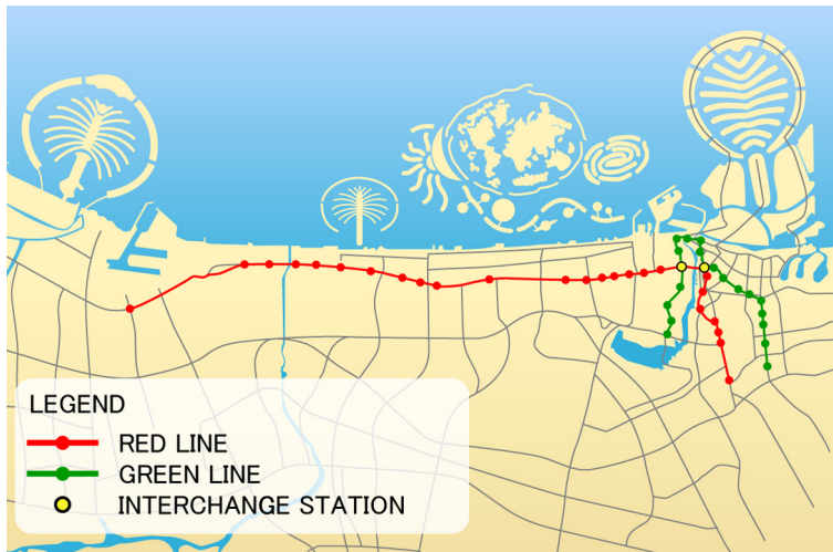
Figure 1 Railroad map