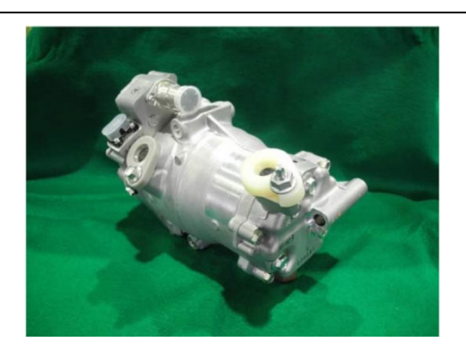
Mitsubishi Heavy Industries Thermal Systems, Ltd. Sales & Planning Department, Automotive Thermal Systems Division

Mitsubishi Heavy Industries Thermal Systems, Ltd. (MHITS) has been marketing electric compressors for air conditioning systems for hybrid and electric vehicles since 2007 and has achieved reduced size and weight, as well as high efficiency, through the introduction of its unique scroll technology, inverter control system and optimized internal structure<sup>*1</sup>. In order to secure a higher level of in-car quietness, MHITS has now developed a new electric compressor that reduces the vibration by about 25% compared with the current model while maintaining the same size and performance, by optimizing the balance through an update of the internal structure.