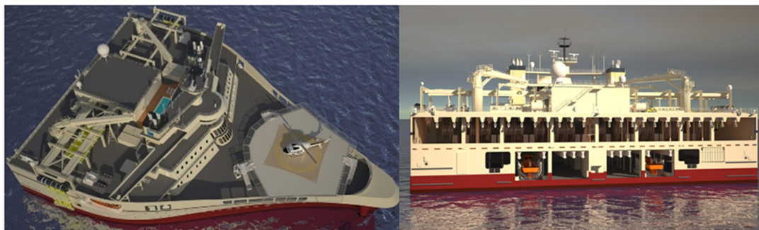
Figure 2 As-built drawing of the Titan-class Ramform