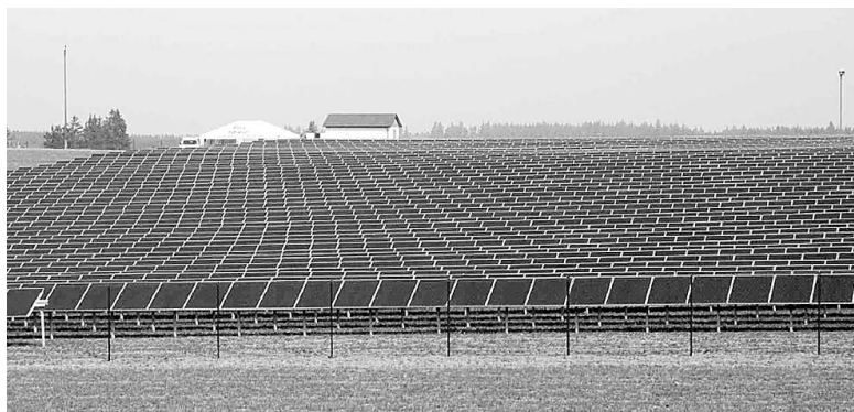
Fig. 1 400 kW solar cell power plant in Germany Approximately 4 000 thin film type 1.1 m × 1.4 m photovoltaic modules produced by MHI are working satisfactorily.

In order to encourage introduction of solar cells, New Energy and Industrial Technology Development Organization (NEDO), together with the Industry-Government-University, is making efforts toward further cost reduction.