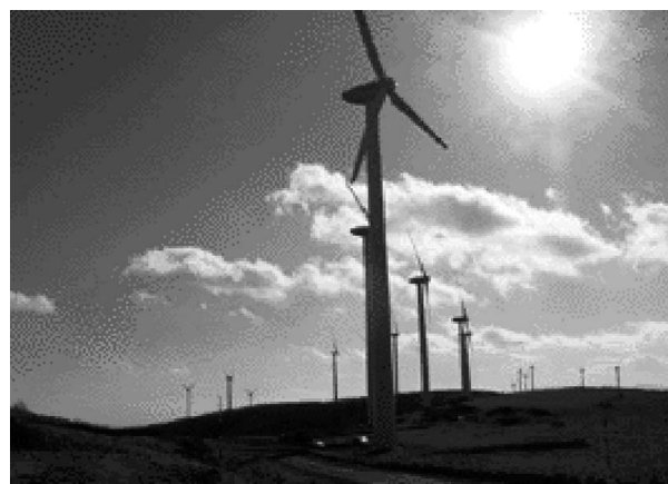
Fig. 3 Kamaishi wide region wind farm, the largest in Japan 42 900kW: Mitsubishi MWT-1000A wind turbine 43 units.