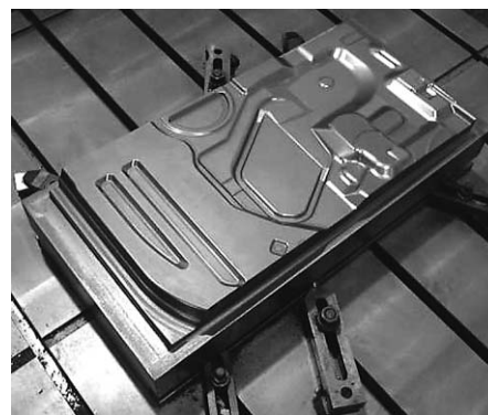
Spindle: 3200 min -1 Cutting feed: 1.6 m/min φ 20 carbide ball end mill Pick: 0.4 mm

Fig. 5 shows the die for automobile inner panels, which does not need the milling surface quality and the milling speed as high as that of the automobile outer panels. However, the die for automobile inner panels consists of the complicated shapes. Various attachments (MVR-FM universal head etc.) and precision positioning of cross rails to an arbitrary place is possible, ensuring machining freedom for realization of high productivity.