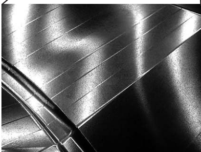
Spindle: 12000 min -1 Cutting feed: 8 m/min φ 30 ball end mill Pick: 0.5 mm