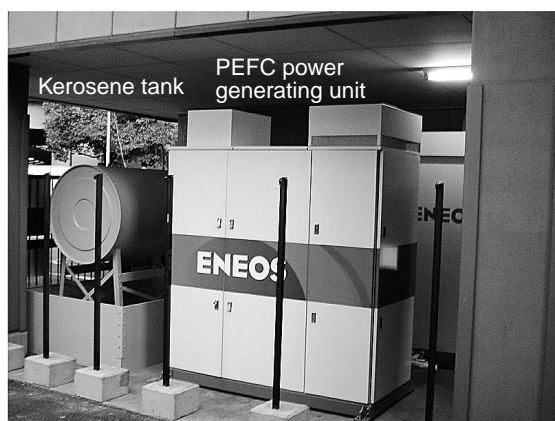
Fig. 2 10 kW commercial PEFC (PEFC using kerosene)