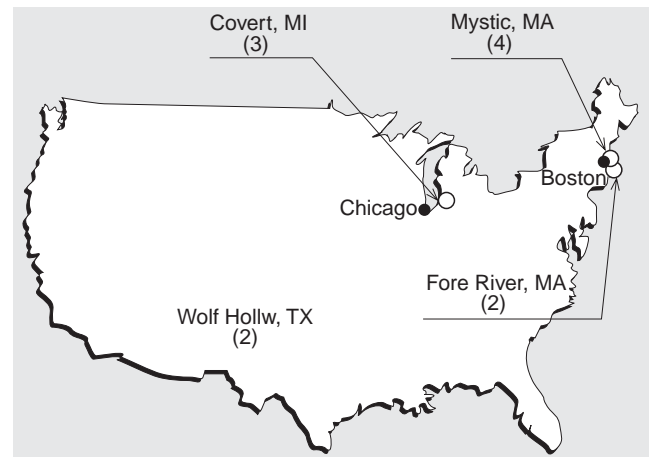
Fig. 1 Locations of M501G combined cycle plant in USA Figure in the bracket indicates the number of provided M501G gas turbine.

In the area of the plant, there is also an existing conventional-type power plant (Block 7) next to Block 8 and Block 9. (See Photo at the top of this page; Block 7 on the left.) During start up period, in order to supply necessary cooling steam to gas turbine combustors, auxiliary steam is lead from this existing block to Block 8 and/or Block 9, or supplied between Block 8 and Block 9 each other.